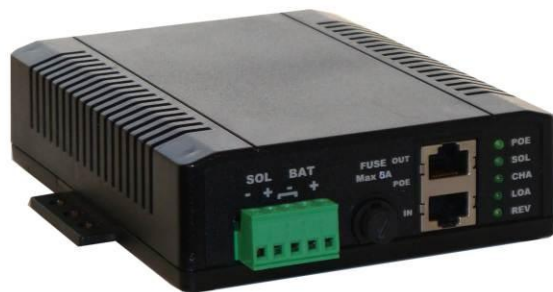
TP-SCPOE-2424-HP Charge Controller