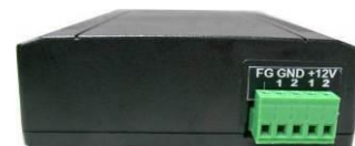
Back panel view