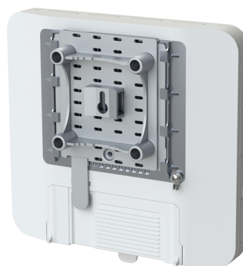
Secure wall/pole mount