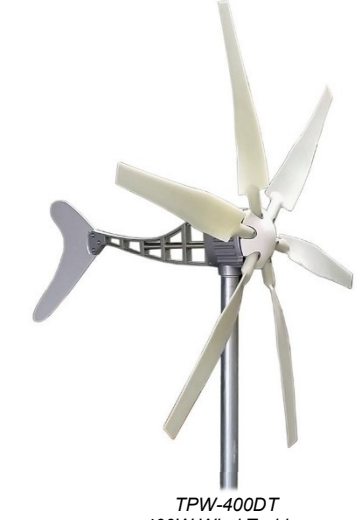
400W Wind Turbine