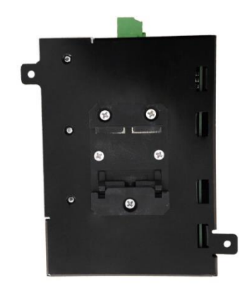
DIN Rail Attachment Bracket