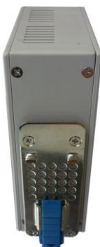
DIN Rail Attachment