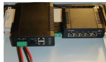
DIN Rail Mounted Controller / Switch