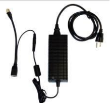
POE Power Supply/Inserter