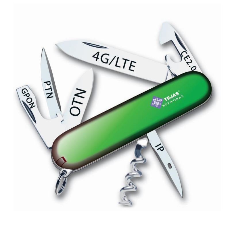
Swiss Army Knife Platform

Multi-Service Support: High speed enterprise services through CE2.0, IP-VPN and MPLS-TP, Network modernization through circuit emulation, legacy TDM applications on SONET/SDH, broadband wireless access, Gigabit fiber broadband through GPON and NG-PON and next-generation mobile backhaul through PTN, OTN and WDM.