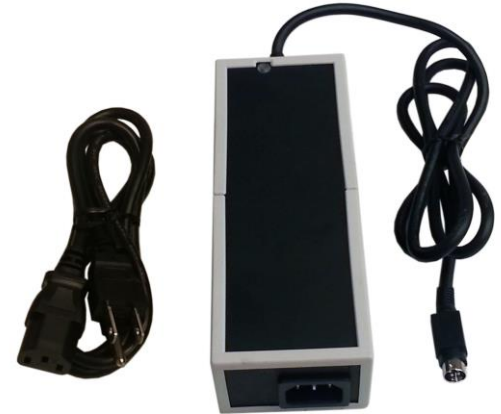
180W DIN Connector Model