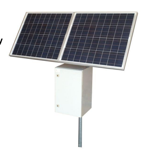
160W / 320W Solar Mount