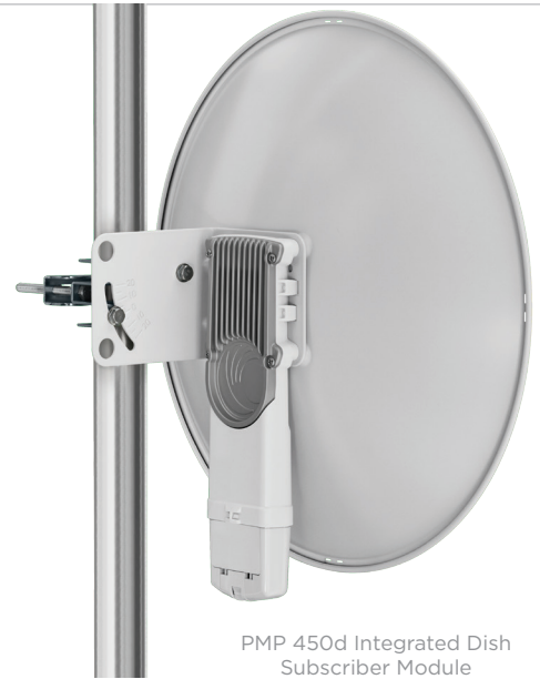
PMP 450d Integrated Dish Subscriber Module