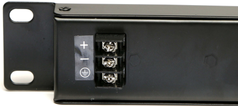
secondary wired DC input with ground