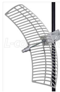
Tilt & Swivel Mast Mount