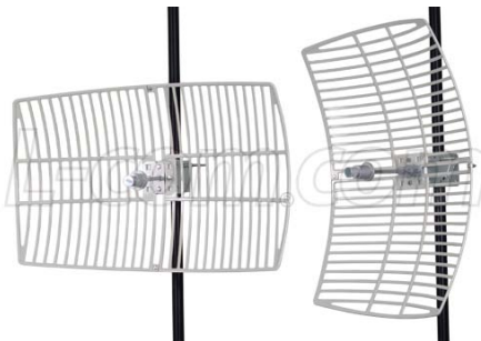
Vertical or Horizontal Polarization

This antenna is supplied with a 60-degree tilt and swivel mast mount kit. This allows installation at various degrees of incline for easy alignment. They can be adjusted up or down from 0° to 60°.