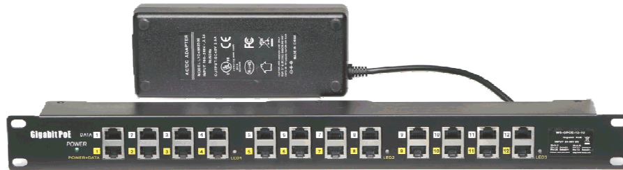
Single Supply version

Using your WS-GPOE-12-48v 1U high rack mount Gigabit power injector for 802.3af or 48 volt devices