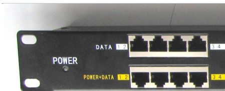
12, 16 and 24 port rack mount passive or 802.3at