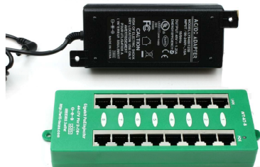
8 port wall mount passive or 802.3at