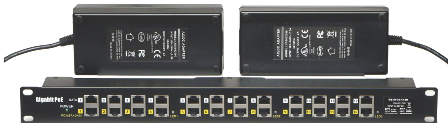
Dual supply version