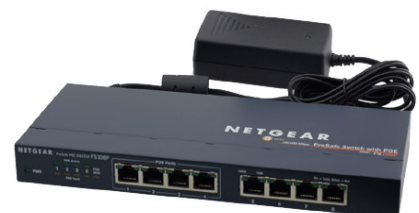
Any PoE Switch