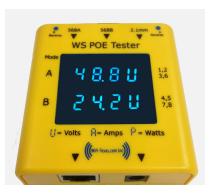
PoE Tester also from WiFi-Texas

Typical device powered by Passive 24v PoE