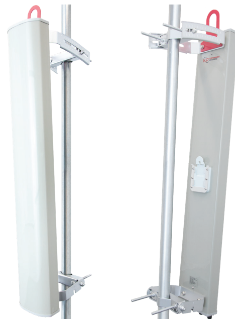
KPP-3SX4-33 example: 3.5 GHz to 4.2 GHz, 33 Degree Sector Antenna, 18.5 dBi 4-Port, ±45 Slant