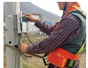
WORK BELT On a Telephone pole