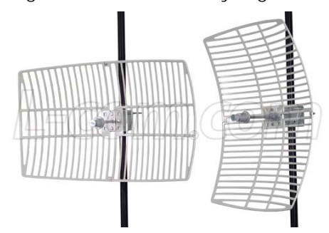
Vertical or Horizontal Polarization

This antenna is supplied with a 60-degree tilt and swivel mast mount kit. This allows installation at various degrees of incline for easy alignment. They can be adjusted up or down from 0° to 60°.