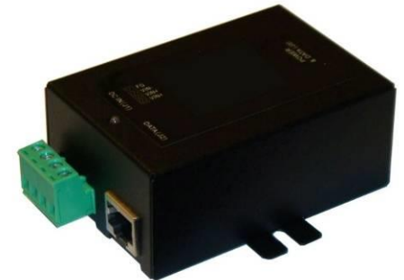
TP-DCDC-1248M (Metal Enclosure)