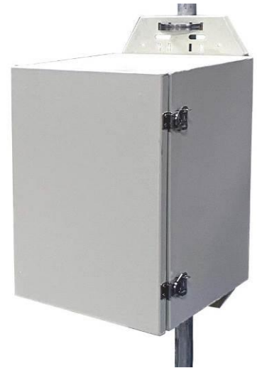
ENC-AL-21x14x15 Aluminum Enclosure

The enclosure is corrosion resistant for long service life. Enclosure material is powder coated aluminum. All hardware is stainless steel.