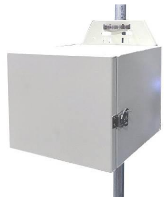
ENC-AL-12x14x15 Aluminum Enclosure