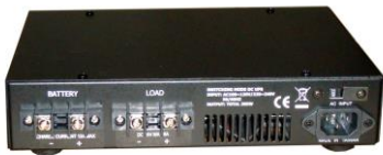
Smart 300W Charge Controller