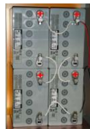
24V 102Ah Battery Configuration