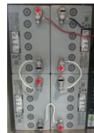
48V 51Ah Battery Configuration